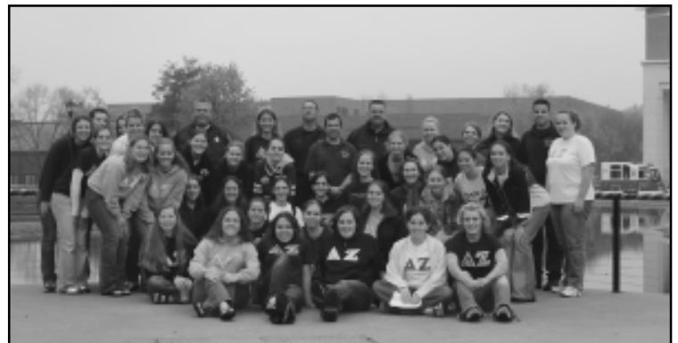
Collegians gathered at Bowman Pond for the Turbo Turtle Trek Fundraiser in October.