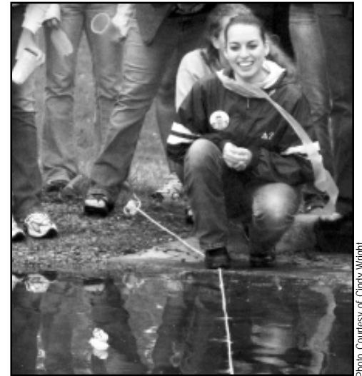
Two turbo turtles approach the finish line in a close finish.

The first ever Delta Zeta Turbo Turtle Trek took place on Wednesday, October 27, and despite a bit of drizzle, was quite a success. For several weeks leading up to the event, chapter members sought out students, faculty, and family who sponsored little rubber turtles for $5 each. On the day of the event five hundred sponsored turtles were dumped into Bowman Pond and pushed across by the hoses of the Greencastle Fire Department. It was quite exciting as they neared the finish line, especially since the sponsor of the victorious turtle won a trip to Colorado! The proceeds from the event were given to the Greencastle Fire Department to aid in the purchase of smoke alarms for the hearing impaired.